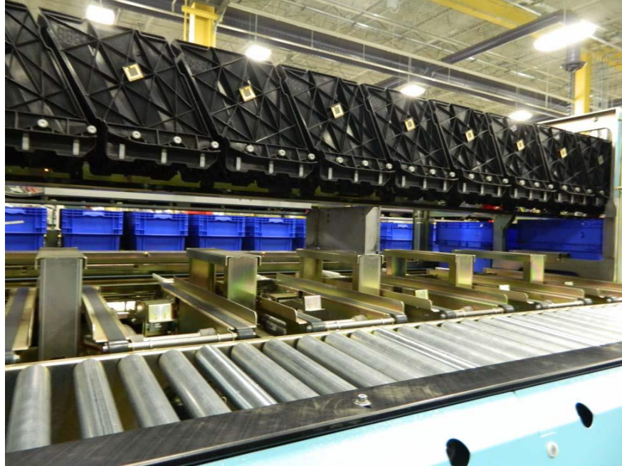
Defs.' Mot. Ex. 10 (photograph of rails, blue plastic bins, and conveyor buckets).