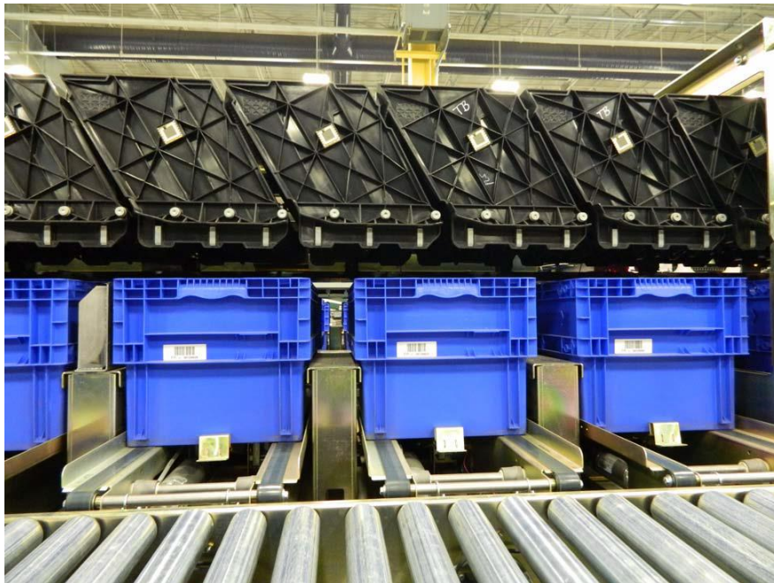
Defs.' Mot. Ex. 3 (photograph of blue plastic trays below conveyor buckets).